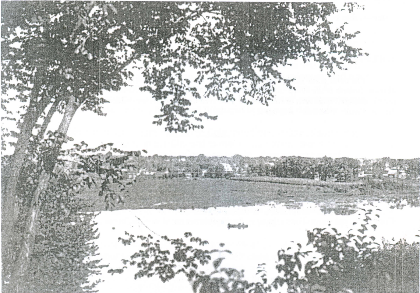
View of Cummings Bride area (Vanier) in Gloucester, from Sandy Hill in Ottawa, circa 1920s.