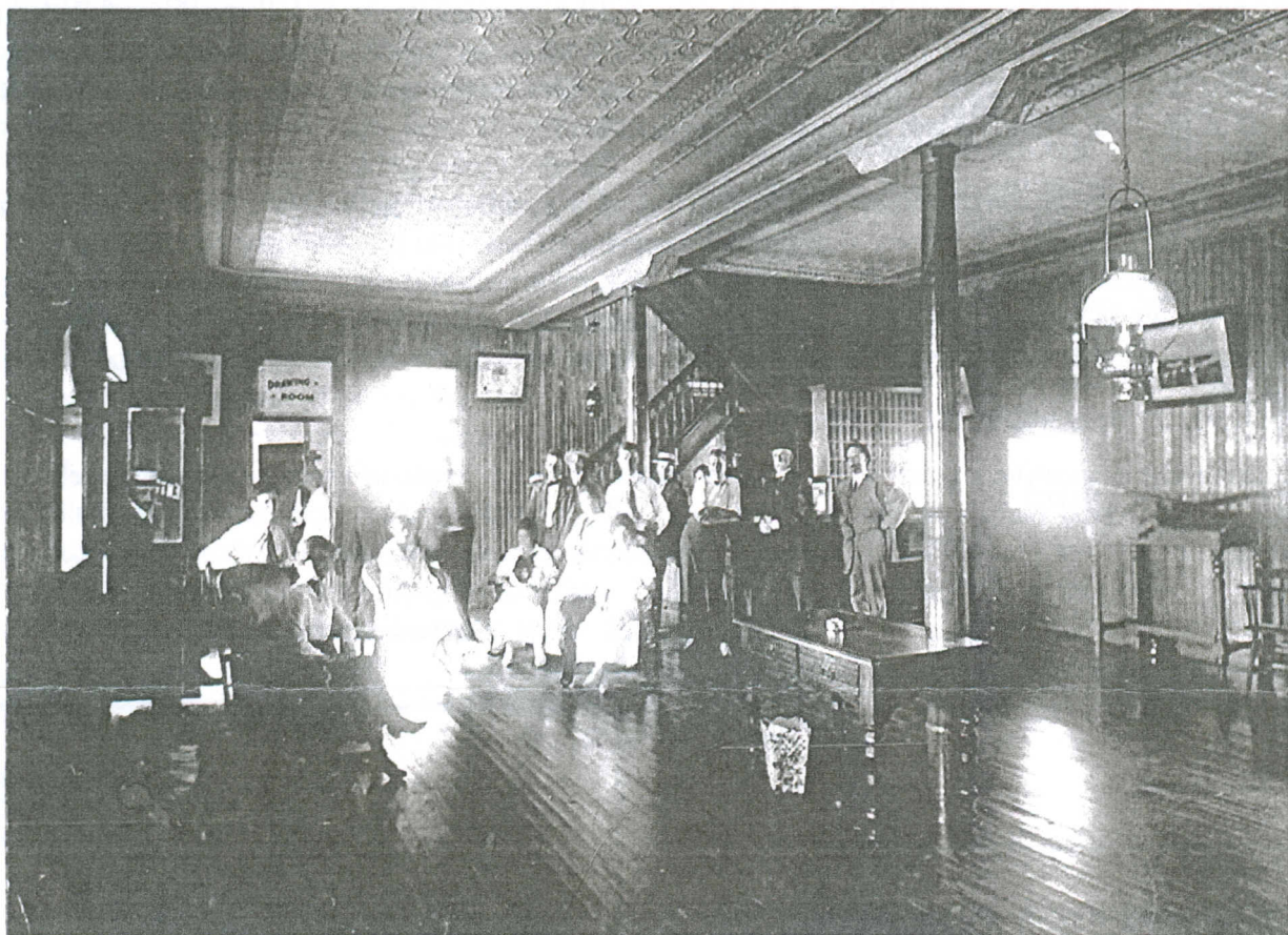
The Lobby of the Carlsbad Springs Spa, circa 1909