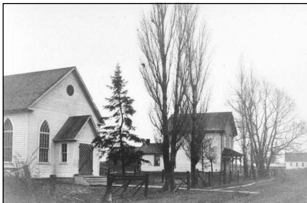
This was the East Gloucester Presbyterian (United) Church and Manse, Ramsayville, 1870-1915

In 1925, following a vote of communicants, both St. David's and East Gloucester Churches joined the United Church of Canada. [Source- East Gloucester Presbyterian Pastoral Charge History, 1860-1925, a booklet prepared for Bethany Heritage Sunday, June 24, 2001]