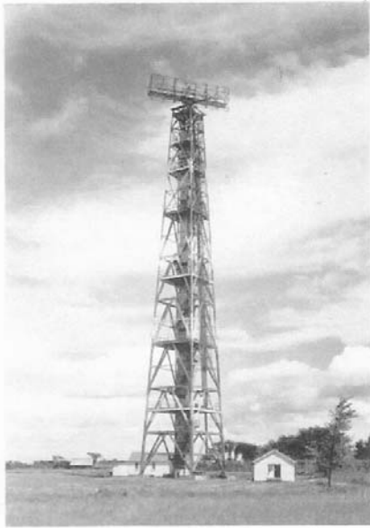
RADAR IN USE

Long-Range Early Warning Tower at Metcalfe Road Field Station developed for the R.C.A.F. by the Council. The antenna at the top finds the range and direction of aircraft out to 100 miles. Antennae up the side of the tower give the height of the aircraft.