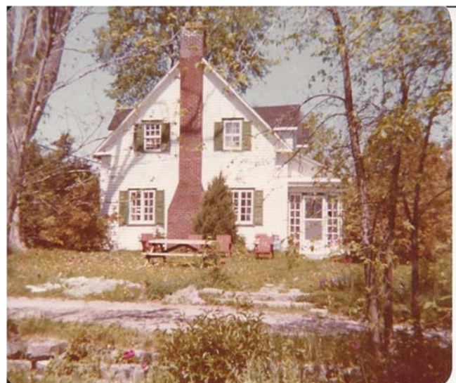
The Murphy/Kenny House As It Looked In The 1960s or 1970s and Much As It Looks Today.